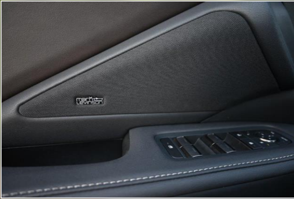
21 SPEAKER MARK LEVINSON PREMIUM AUDIO SYSTEM