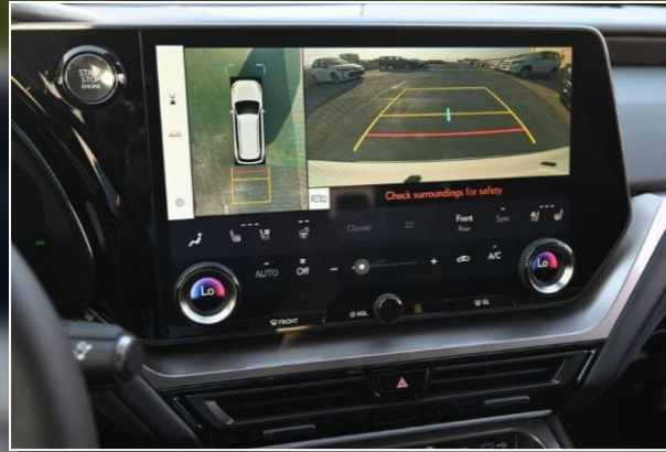
PANORAMIC VIEW MONITOR