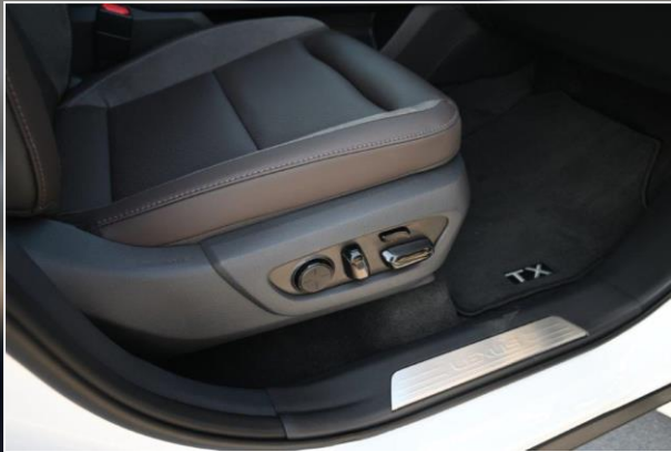
10-WAY POWER DRIVER AND PASSENGER SEATS