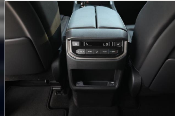
REAR AC & USB PORTS