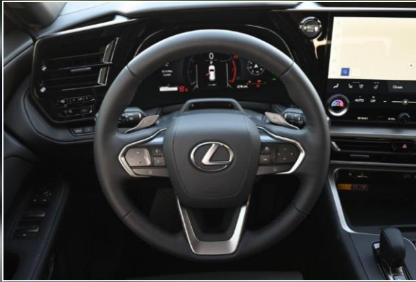
ADVANCED TOUCH STEERING WHEEL