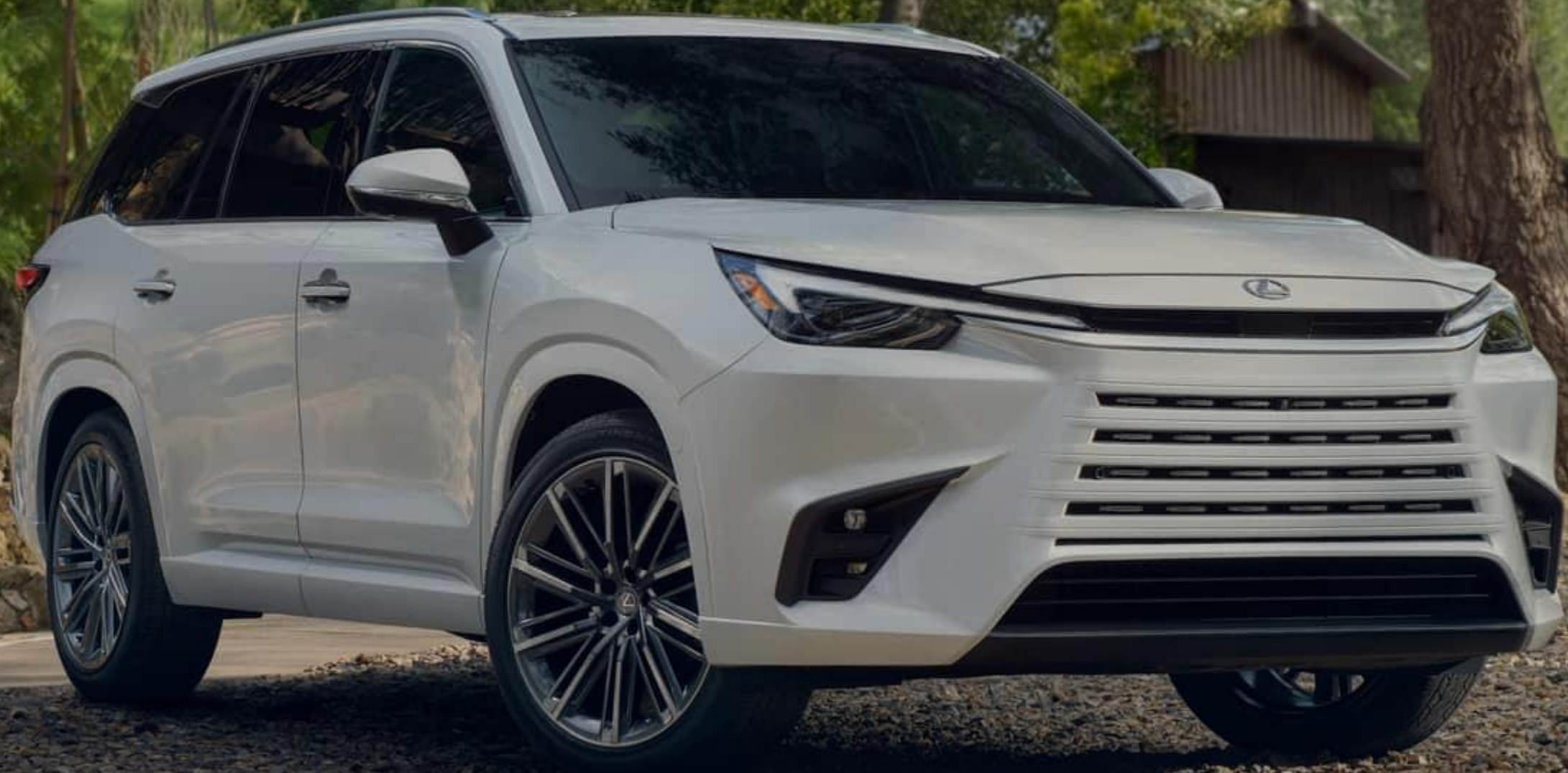
Lexus TX 350