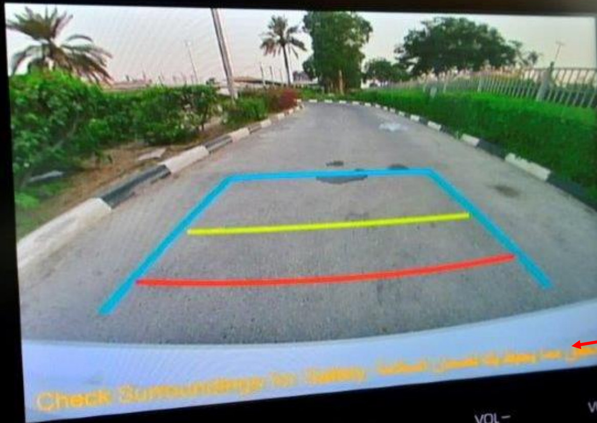
8 INCH TOUCH SCREEN